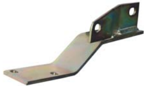
Commodore V6 VX/VY Bracket